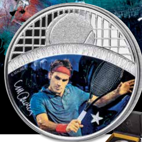
2018 $5 SID MAURER ROGER FEDERER 1oz SILVER PROOF