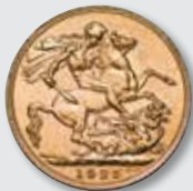
The controversial restrike See page 9