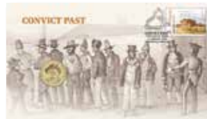
2018 $1 RASCALS & RATBAGS PNC Official Issue Price

Highlighted by a brilliantly illustrated cover, this PNC includes a 'New South Wales Colony' Australian stamp and the RAM's unique Rascals & Ratbags $1. Limited edition just 7,500!