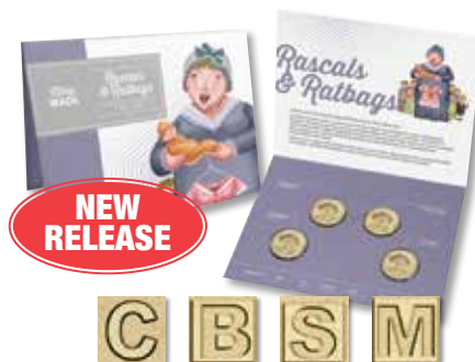
2018 $1 RASCALS & RATBAGS AL-BR MINTMARK 4-COIN SET Official Issue Price