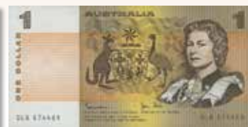
1982 R78 JOHNSTON/STONE UNC