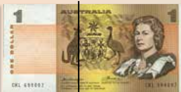
1976 R76C KNIGHT/WHEELER SIDE THREAD UNC