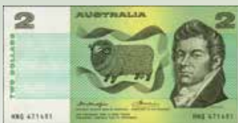
1976 R86a KNIGHT/WHEELER GOTHIC HNQ 471491