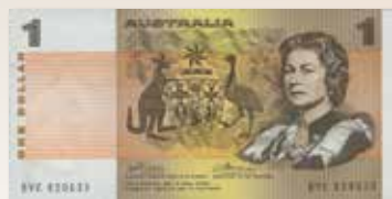
1974 R75 PHILLIPS/WHEELER 'AUST' UNC