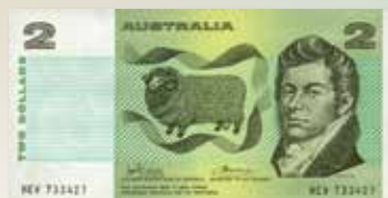
1974 R85 PHILLIPS/WHEELER AUST AUSTRALIA