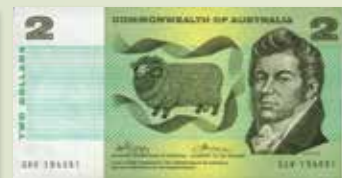
1972 R84 PHILLIPS/WHEELER C OF A COMMONWEALTH OF AUSTRALIA