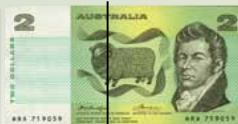
1976 R86b PHILLIPS/WHEELER OCR-B CENTRE THREAD HRA 719059