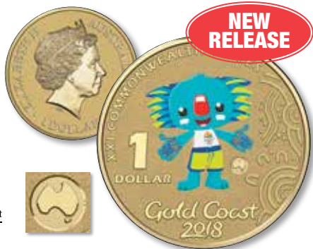
2018 $1 BOROB1 COMMONWEALTH GAMES MASCOT COUNTERSTAMP AUSTRALIA AL-BR UNC