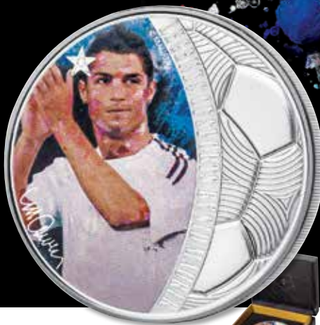
2018 $5 SID MAURER RONALDO 1oz SILVER PROOF