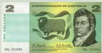
1967 R82 COOMBS/RANDALL