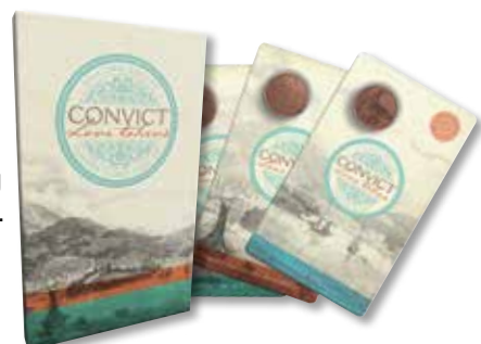
2016 $1 CONVICT LOVE TOKEN TRIO CU-NI UNC Official Issue Price