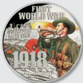
WWI Armistice See page 5