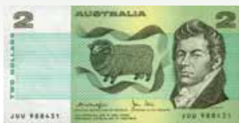
1979 R87 KNIGHT/STONE