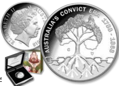
2018 $1 RASCALS & RATBAGS SILVER PROOF Official Issue Price