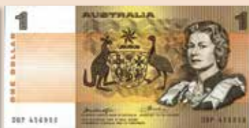
1976 R76B KNIGHT/WHEELER DBP TEST NOTE UNC