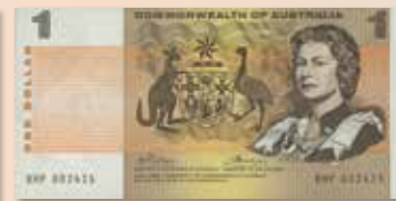
1972 R74 PHILLIPS/WHEELER 'C OF A' UNC