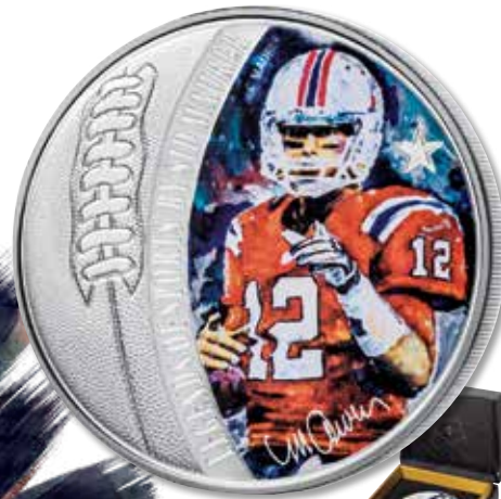
2018 $5 SID MAURER TOM BRADY 1oz SILVER PROOF