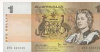
1979 R77 KNIGHT/STONE UNC