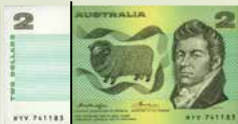
1976 R86c KNIGHT/WHEELER SIDE THREAD