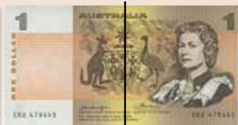
1976 R76A KNIGHT/WHEELER CENTRE THREAD UNC