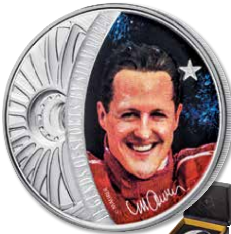
2018 $5 SID MAURER MICHAEL SCHUMACHER 1oz SILVER PROOF