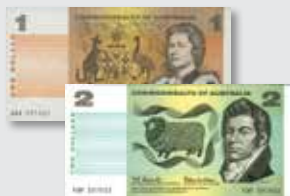
Complete paper banknote collections See pages 16&17