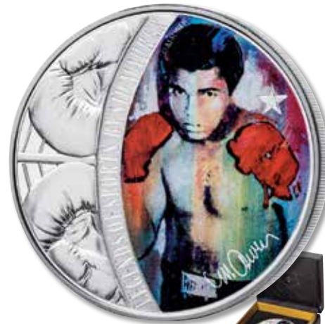
2018 $5 SID MAURER MUHAMMAD ALI 1oz SILVER PROOF