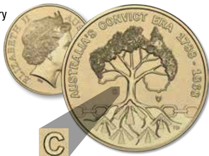
2018 $1 RASCALS & RATBAGS C MINTMARK AL-BR UNC