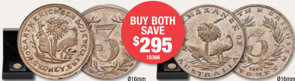
1858 HOGARTH & ERICHSEN 3D A687 aUNC

Among the very few Australian silver Trade Token types, the Silver 3d Tokens of Sydney jewellers Hogarth, Erichsen & Co are rare artefacts of the Gold Rush. Rated 'rare' by Renniks, the 1860 Silver 3d is available in superb about Uncirculated condition, with the 'very rare' 1858 Silver 3d also in aUnc quality. Seldom seen so nice – do not miss this rare opportunity!