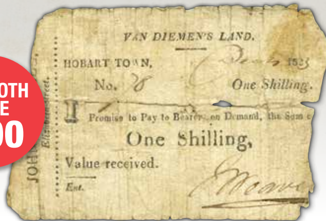
1823 JOHN WEAVELL HOBART SHILLING NOTE FAIR-FINE